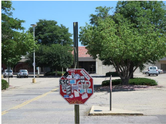
Blight Factor (e): Deterioration of Site or Other Improvements: Deteriorated signage